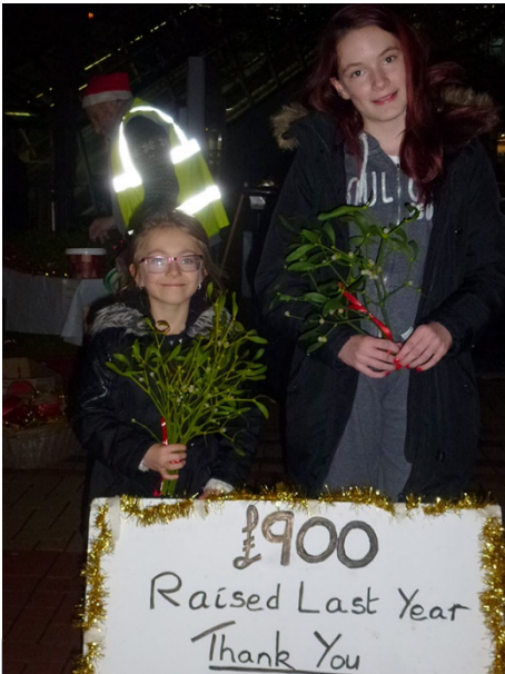
One of the many generous families from Coventry

A Happy new year from the Coventry Tree Warden Network.