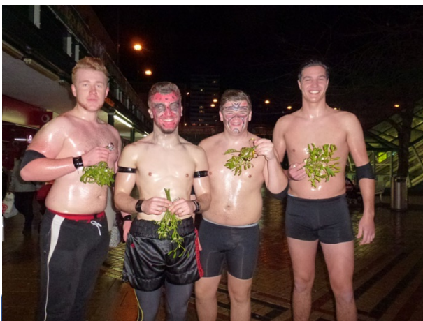
Members of the Coventry University Rugby Club