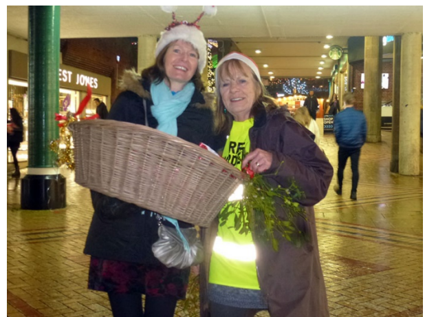
Two of "Santa's Little Helpers"